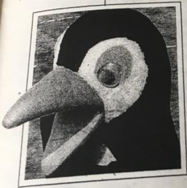
Above: The headwear from the five-a-side bibs.

This is by no means a typical game of five-a-side, however. The bibs the players wear are not the normal style but consist of attached head pieces on a rather large scale. These headpieces completely obstruct any form of vision and so each team designates a non-playing coach. This coach is given a loudhailer with which to instruct his team on the direction to move, pass or shoot.